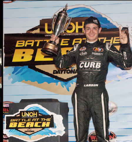
Kyle Larson's first Daytona Speedway NASCAR victory was at the Daytona Battle at the Beach in our Curb car.

We had our 3rd victory at Las Vegas in 2021 and a win at Indy in 2023 with the ThorSport/Curb team.