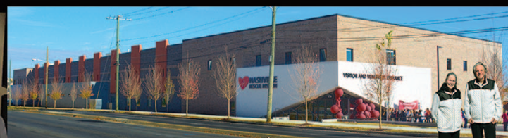
Linda and Mike Curb Women and Children's Center at The Nashville Rescue Mission

We continued our relationship at Room In The Inn with a new building and our Curb Welcome Center at Second Harvest Food Bank, the Matthew 25 homeless project, Safe Haven and the Curb Center for Social Enterprise at Crossroads. We also partnered with the Carter Center to co-sponsor Jimmy and Rosalynn Carter's final work project for Habitat for Humanity in 2019.