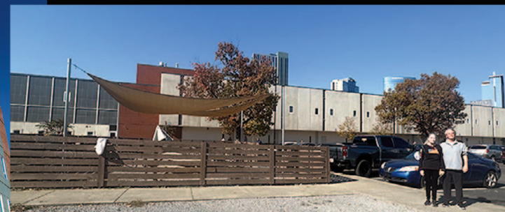
Linda and Mike Curb Men's Center at the Nashville Rescue Mission

The Linda and Mike Curb Center for men at the Nashville Rescue Mission was joined in 2023 by the opening of the new women and children's center.