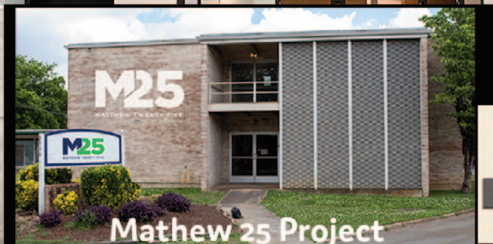
Mathew 25 Project