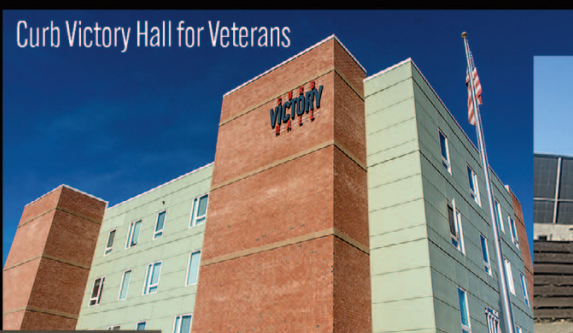
Curb Victory Hall for Veterans

This past decade we have tried to focus on all of our charitable programs and we are particularly proud of our homelessness initiatives starting with the opening of the Curb Victory Hall for Veterans which opened in 2020.