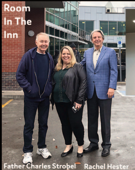
Room In The Inn

This past decade we have tried to focus on all of our charitable programs and we are particularly proud of our homelessness initiatives starting with the opening of the Curb Victory Hall for Veterans which opened in 2020.