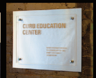
STELLA CURB TEACHER TRAINING CLASSROOMS