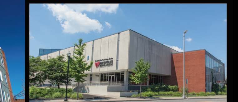
Linda and Mike Curb Men's Center at the Nashville Rescue Mission

The Linda and Mike Curb Center for men at the Nashville Rescue Mission was joined in 2023 by the opening of the new women and children's center.