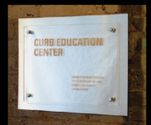
STELLA CURB TEACHER TRAINING CLASSROOMS