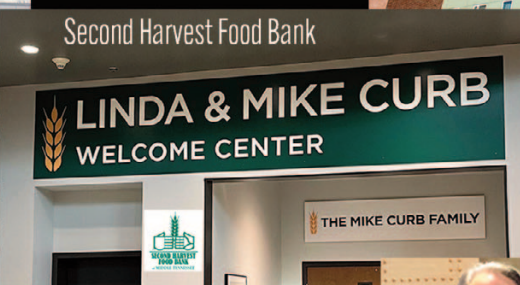
Second Harvest Food Bank